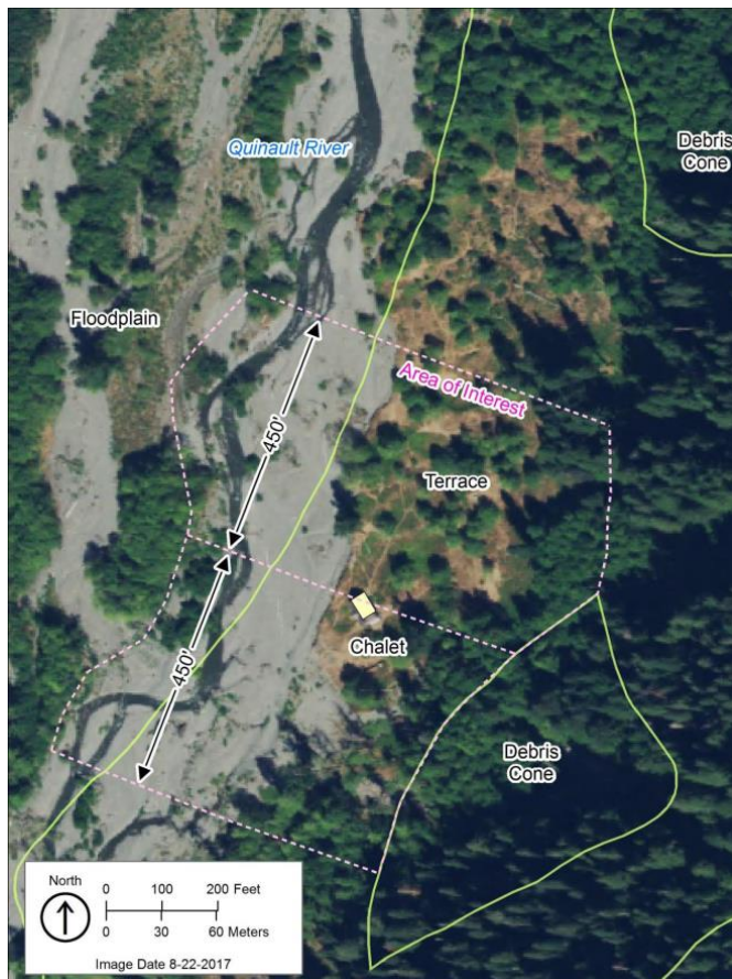
Figure 2: Site Flood Hazard Analysis Area (which includes the potential move sites)

The chalet would require periodic maintenance that would be completed in accordance with the Secretary's Standards for the Treatment of Historic Properties and within all applicable wilderness and historic preservation laws. Maintenance activities would be completed with traditional hand tools and stock support. A portion of the chalet may be designated an emergency shelter. The chalet may also be used administratively.