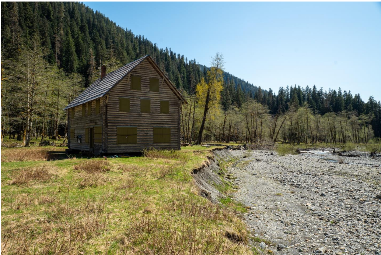
NPS Photo: May 2020