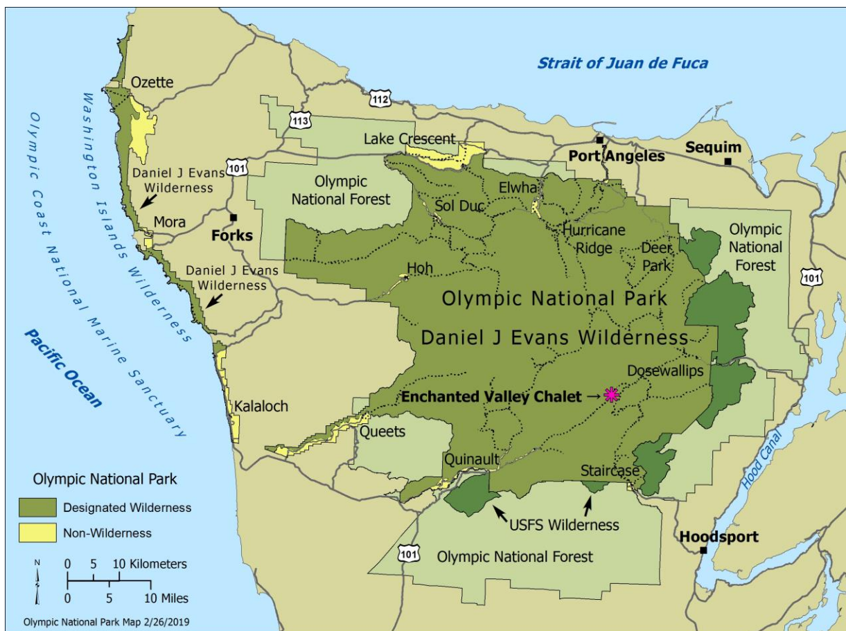
Figure 1. Map of Project Location

The Enchanted Valley Chalet is located 13 miles up the mainstem or “east fork” of the Quinault River (hereinafter referred to as “Quinault River”) from the Graves Creek Trailhead, at an approximate elevation of 2,030 feet, within the congressionally-designated Daniel J. Evans Wilderness (designated in 1988 as the Olympic Wilderness). See figure 1.