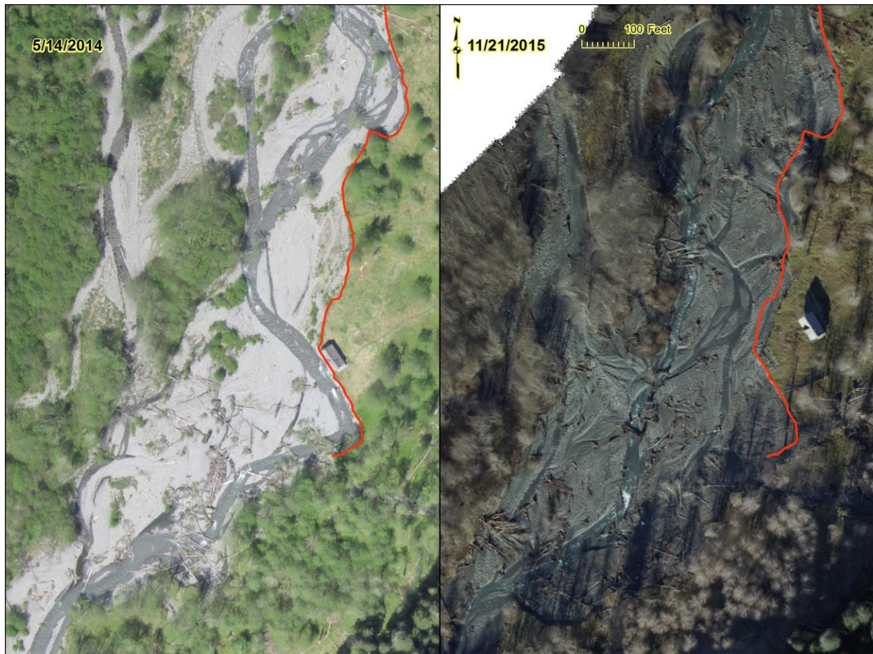
Figure 7: Photo Comparison of Bank Location Relative to the Chalet

As of May 2018 the nearest edge of the bank was approximately 10 feet from the chalet due to continued bank erosion, and then the river shifted northwest toward the valley wall and away from the alluvial bench on which the chalet currently resides. The chalet currently remains on the