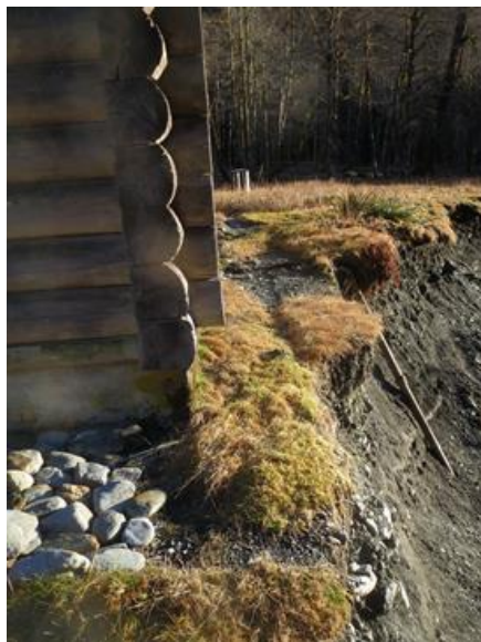
Figure 3: Photos January 2014

In October 2013, park staff on-site noted that the river channel was 9 feet from the northwest corner of the chalet. In winter of 2013/2014, the area experienced rainfall that was above average, storm events, and high flows that resulted in the Quinault River’s main channel shifting by at least 15 feet since the initial report of river movement in October 2013. In early January 2014 (see figure 3), photographs and visitor reports revealed that the Quinault River had migrated to within 18 inches of the chalet. Subsequent monitoring and aerial photos show that the river had undercut the chalet by approximately 6-8 feet and a small portion of the foundation had fallen into the river.