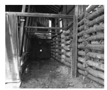
Restored rock crib with reconstructed walls at the Olson Long Ranch.

With the construction season upon us, Heritage Barns are getting some much-deserved TLC. From a hog house in Coupeville to a hop kiln in Yakima, saws are buzzin' and hammers are poundin' as roof replacements, structural stabilizations and foundation repairs get underway. Through the program, grant recipients are required to implement projects in a manner consistent with the Secretary of the Interior's Standards for the Rehabilitation of Historic Properties, ensuring that the historic character and defining features of these buildings will be retained.