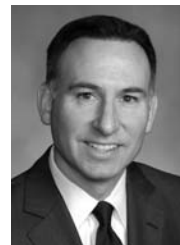
King County Councilmember Dow Constantine (District 8)

For nearly a decade, First United Methodist Church symbolized the challenges associated with balancing historic preservation concerns and the needs of a changing congregation. After a series of appeals, court decisions, redevelopment proposals, and many hours of meetings and negotiations, the historic 1908 sanctuary thankfully will be retained as part of a larger redevelopment effort. Understanding the importance of preserving Seattle’s last historic church in the downtown core, Councilmember Constantine worked effectively with