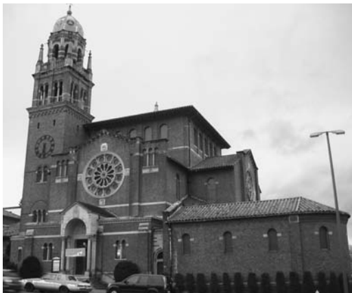
The First Presbyterian Church on Tacoma Ave. S was founded in 1873.

In February, Historic Tacoma initiated discussions to help Tacoma congregations identify the information and resources needed to address capital facilities planning and on-going building maintenance, placed in the context of the church's mission in the community. The group has met monthly to craft an ecumenical approach to the preservation and rehabilitation of these buildings with the goal of crafting a proactive and sustainable program to preserve and rehabilitate Tacoma's historic churches.