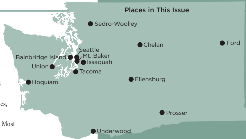
Places in This Issue