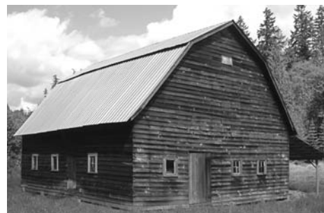
Top to Bottom: Shaffner Barn in Ford, Stevens County; Dunford Ranch in Ellensburg, Kittitas County; and Carlson Farm in Issaquah, King County.