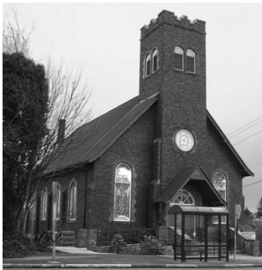
St. Paul Evangelical Lutheran Church, established in 1894.