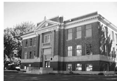
Left to right: Prosser in 1902; the Visitor Information Center; the Benton County Courthouse, Prosser is the county seat.

PROSSER, A SMALL, EASTERN WASHINGTON RURAL COMMUNITY NESTLED AT THE BASE OF THE HORSE HEAVEN HILLS IS RECEIVING STATE AND NATIONAL RECOGNITION FOR ITS WINERIES, AS IS THE SURROUNDING WINE REGION. Economic development growth has increased 500% since 2005, and growing right along with this notoriety has been the community's desire to revitalize the town's downtown core.